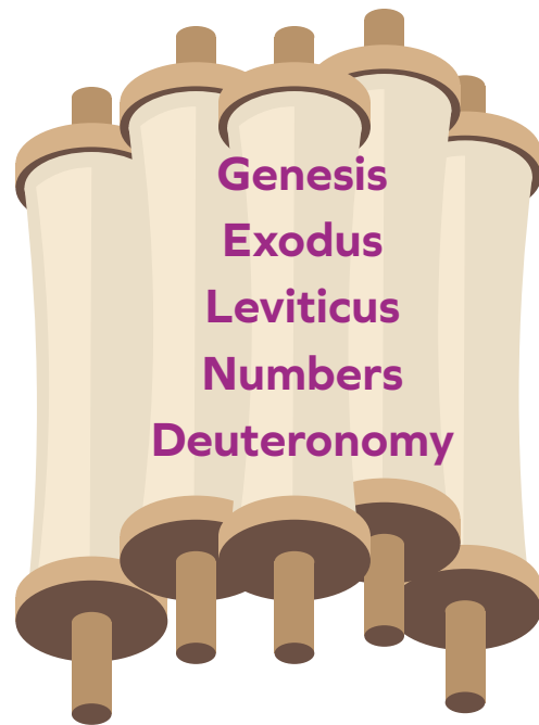
| The Law of Moses

The story ends with the death of Moses and the people were about to enter the Promised Land. The Law of Moses also tells the Israelites how God wanted them to live and to worship. It contains many laws for the people to follow. God