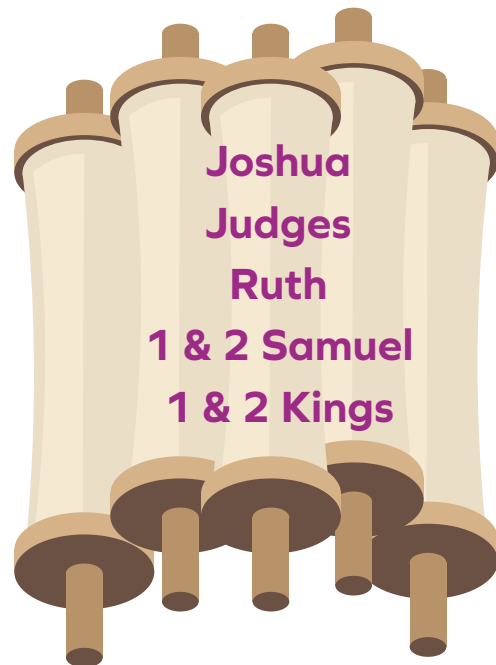
| Books of History

After Joshua, other books of the Old Testament describe the history of the Israelites in the Promised Land. They tell how sometimes the people were faithful to God and sometimes they were not. When the people were faithful to God, they did well. When they were not faithful to God, bad things happened to them.