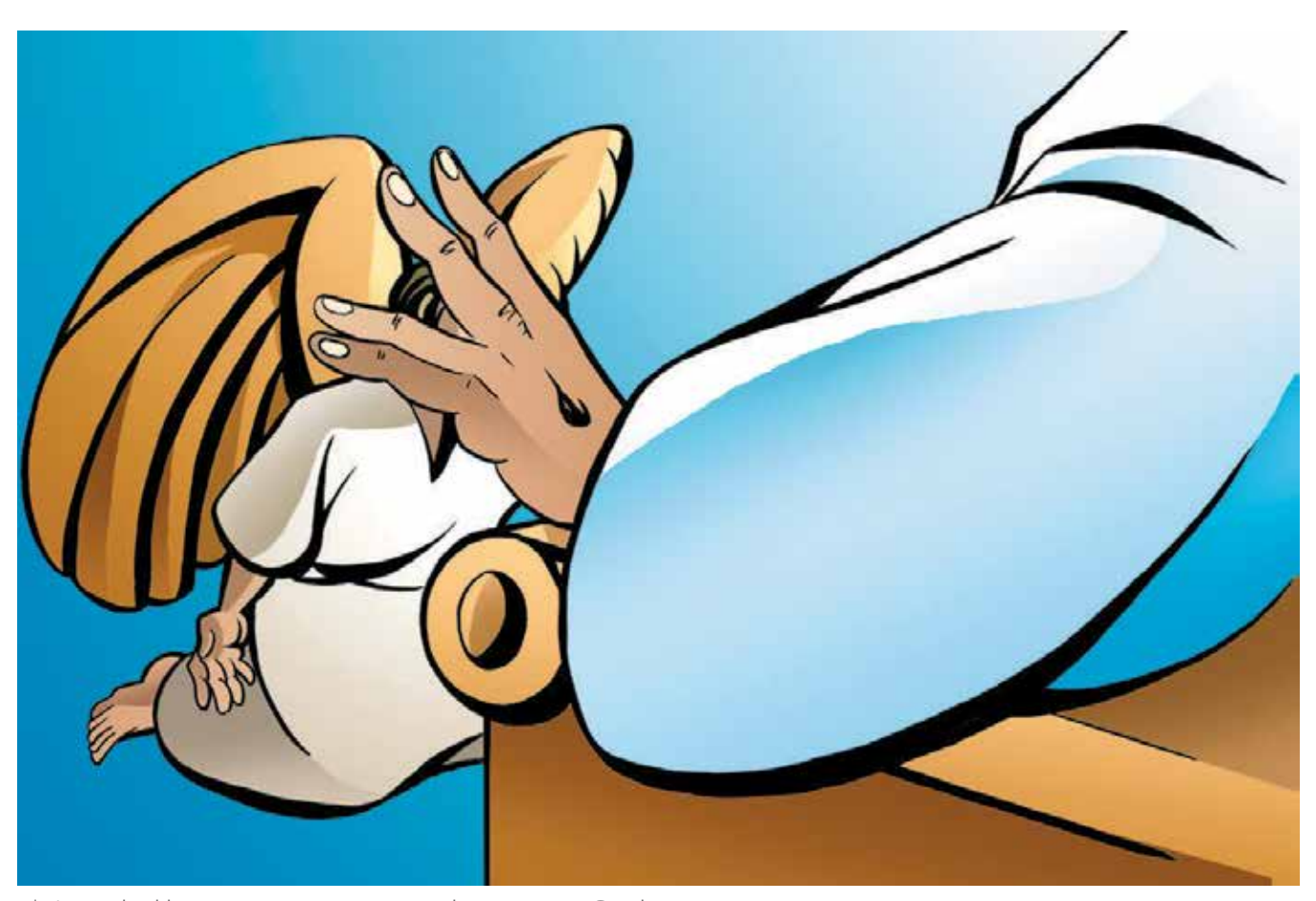
Angels, like men, were created to praise God.

Angels are personal. A third characteristic of angels is that, like people, they are personal beings. They have intelligence and wills. Angels are not impersonal objects like rocks or trees, nor are they just forces like wind or electricity. Impersonal objects and forces cannot think, sing, plan, show emotions, or obey God like people can. Angels do all of these things.