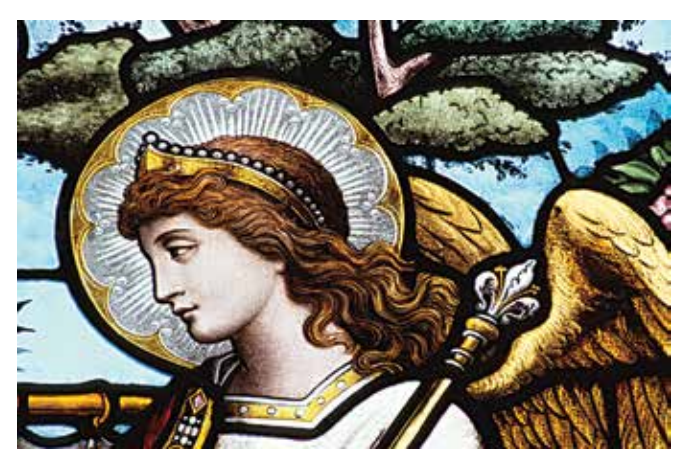
| Angels serve God and Jesus

Bible where angels serve as God's messengers, ministers, and helpers. They point the way to Christ. Let's explore some of the characteristics of angels.