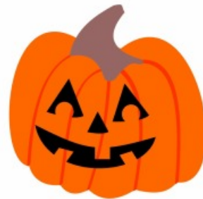
Jack O' Lantern